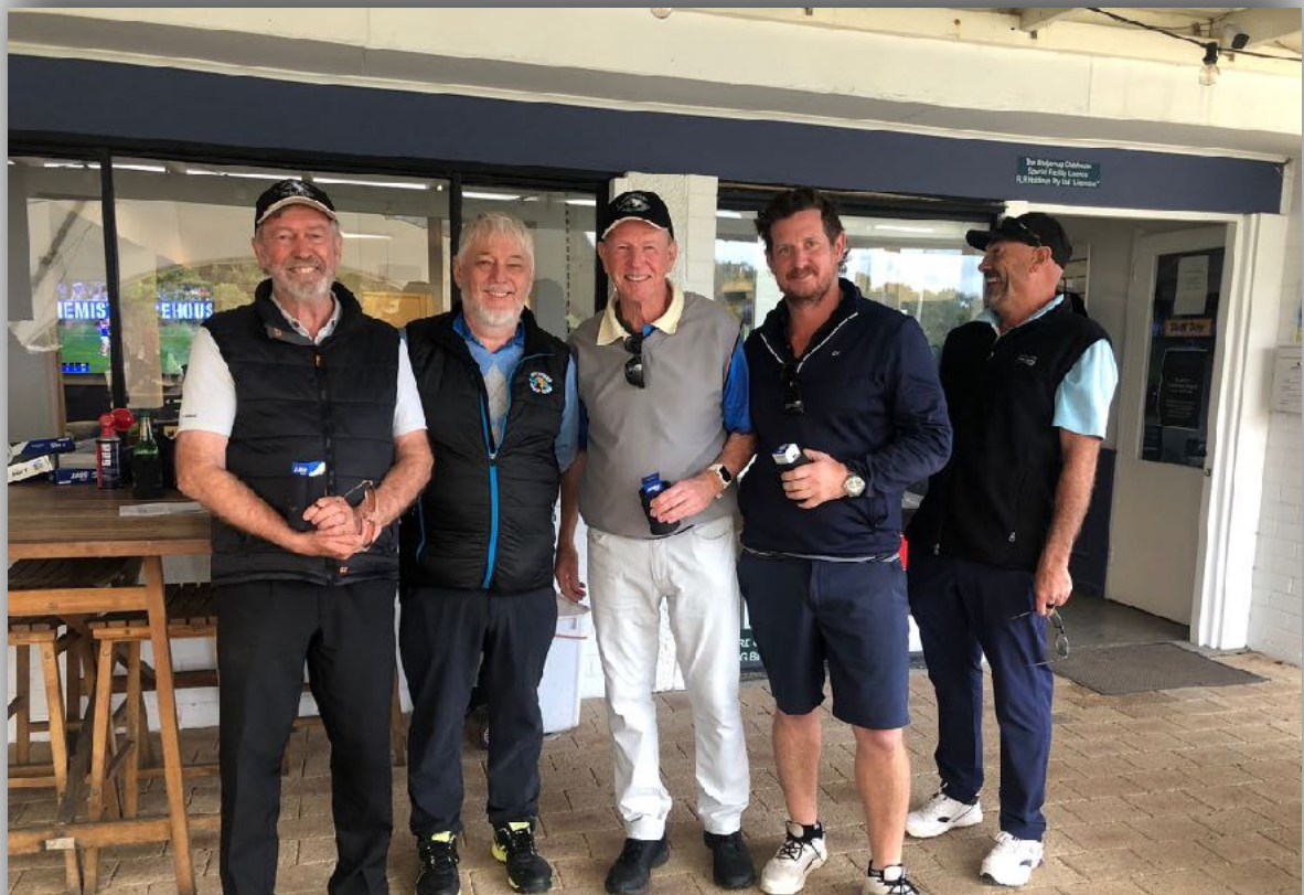
The winning foursome had 6 birdies and an eagle to get the chocolates on 55.65 strokes